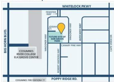
Park Location Map

A 1-acre local park located near Whitelock Parkway and Big Horn Boulevard in the Laguna Ridge Specific Plan (LRSP) area.